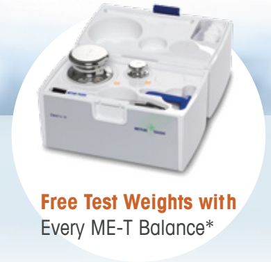
Free Test Weights with Every ME-T Balance*